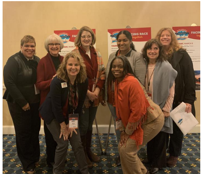
Together SC Conference – 3 Board members, our consultant and 4 staff attending