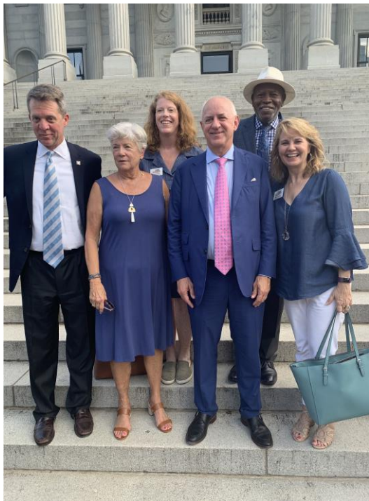
SCFS's 20th Anniversary, Former Gov. Hodges with some RFS staff