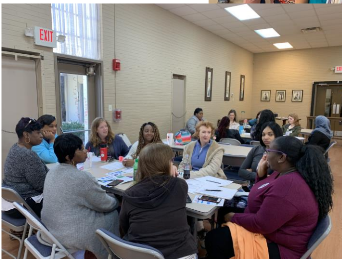
RFS Staff committee meetings – Our committees include Health and Wellness, Connections, Family Engagement, Step Up to School Readiness, and Male Engagement (for families)