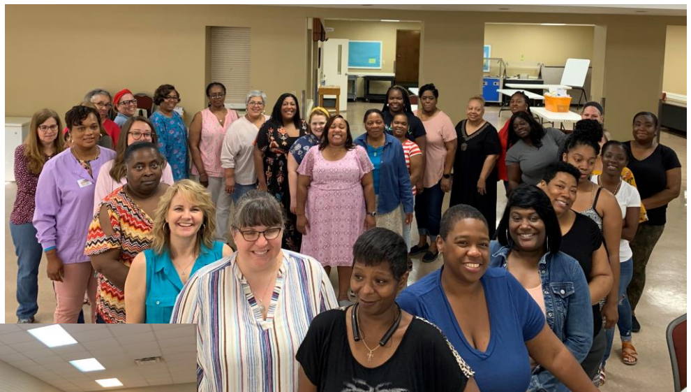
Richland First Steps staff