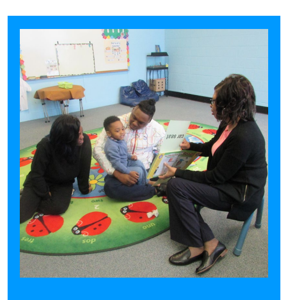
Parent Educator working with a family.