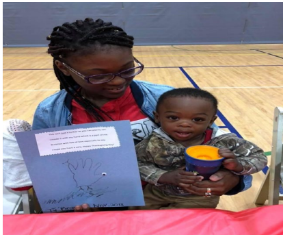
Thanksgiving and Easter Group Connections