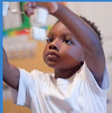
First Steps 4K at A & A Learning Center, West Columbia