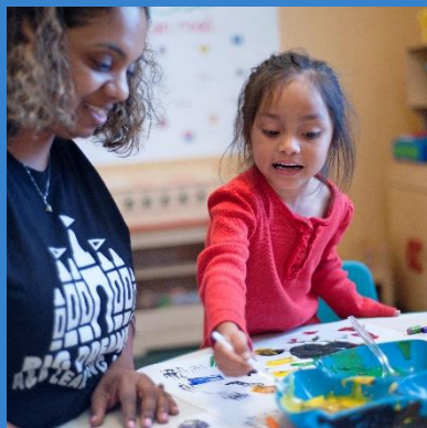
First Steps 4K at A & A Learning Center, West Columbia