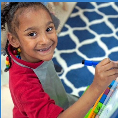
First Steps 4K at Precious One Learning Center, Florence