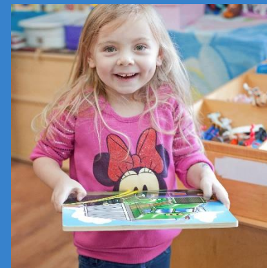
First Steps 4K at Hartman Hall Child Development Center, West Columbia