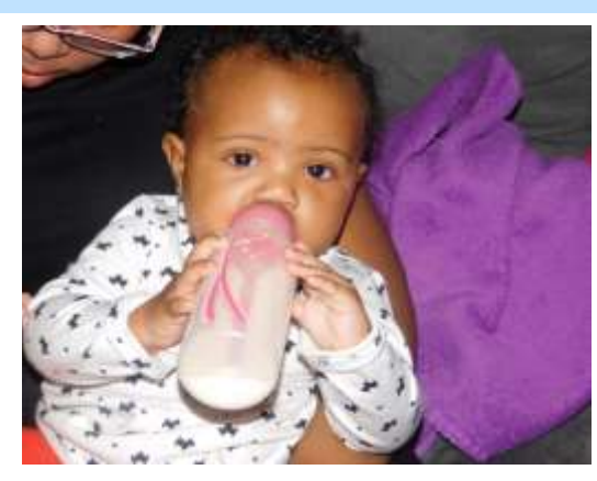
"Sometimes the smallest things take up the most room in your heart."