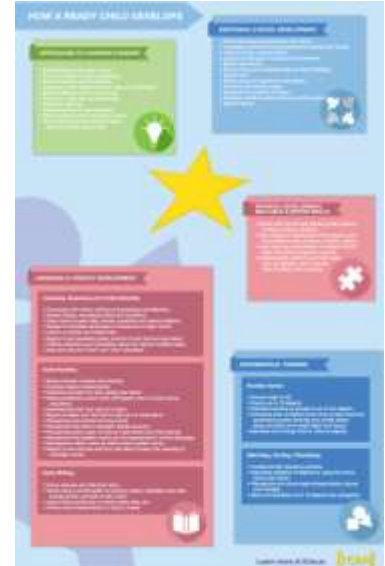
Profile of the Ready Kindergartner brochure