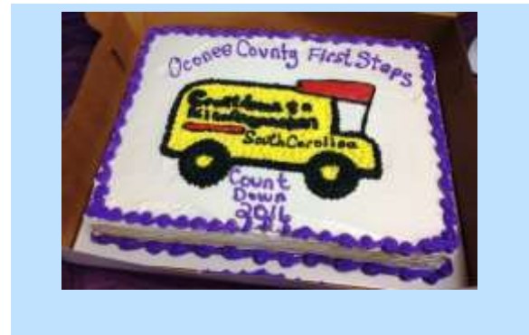
James M. Brown Elementary School Countdown to Kindergarten Children & Families Really Enjoyed the Graduation Cake.

*CTK program data is for June-August 2016, whereas CTK fiscal data includes expenditures from July 1, 2016 through June 30, 2017.