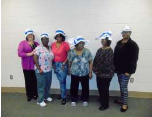
Child Care Providers displaying their art work through curriculum activities. Child Care trainings are fun and interactive.