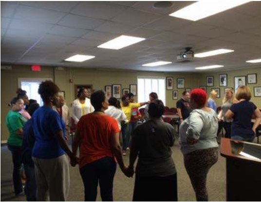
Group building activities, and encouraging interaction among providers outside of a classroom, is an integral part of our trainings.

"This was a refreshing way to review hot topics in leadership, ethics, and program standards!" 94% of attendees felt we offered topics useful to them. 91% felt that they had attained new knowledge that could be applied in the classroom.