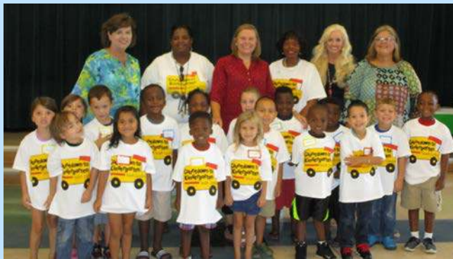
Countdown to Kindergarten 2016

*CTK program data is for June-August 2016, whereas CTK fiscal data includes expenditures from July 1, 2016 through June 30, 2017.