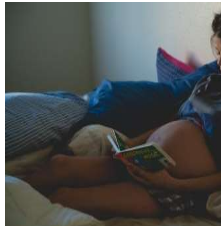
Learning begins prior to birth.

York County First Steps is the implementing agency for Nurse-Family Partnership in Chester, Lancaster, and York County.