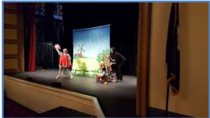
Newberry County preschoolers enjoyed Porkchop Production’s, “Bremen Town Musicians” during the Week of the Young Child.

“Our daughter is always excited to receive a new book from school. She “reads” it to us before she asks us to read it to her. The new stories encourage her to go back and look at the old ones. Many, many thanks for encouraging children to love books.” Preschool Parent