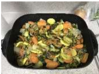
Parents with children in the Early Head Start Program, enjoy a stir-fry at their parent meeting, "How to prepare a nutritious meal on a budget."

We are enjoying having the Early Head Start Program at Newberry Child Development Center. It has not only benefited our facility through giving low income families a chance to have an early start on education, but also has enabled NDCD to help build Newberry's community brighter one child at a time. The program has allowed us to create lasting partnerships with parents and their children. The program also provides great resources for our parents and their families. We are privileged to have this program in our facility. Thank you!