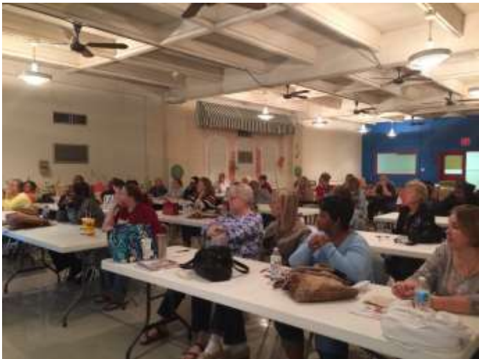
Child Care Providers participating in a child care training session.