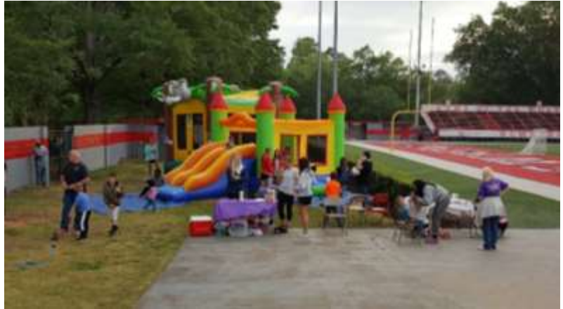
PAT families enjoyed participating in the ten year celebration of Newberry County School District's Family Literacy Program.

A family with a 49-month old child enrolled in our program and our Bright Beginnings Child Development Center. He had been born with congenital heart problems and had resulting surgeries. His mother was understandably very concerned and protective, but was more comfortable with his being in a small class. His pre-screening showed some deficiencies in communication, fine motor, problem solving, and social skills. The child progressively learned to follow the class routines, play with the other students, and participate in class activities. His mother was surprised at his gains in maturity and independence, and as a result became a full partner in his developmental and educational goals. She and his father become more active in the parenting group sessions. His mother was our guest speaker at our Spring Council meeting to share her families' journey with our program this year. His post-screenings showed improvements in all areas, but it was decided to have him evaluated by School District Special Services, in hopes of his qualifying for services over the summer. His mother plans to bring him back to our center for the 2016-17 school year, as well as participate in the 2016 summer activities.