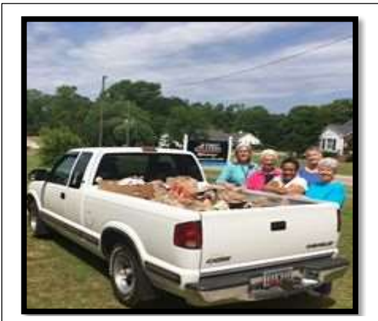
Volunteers sorted, shelved and distributed more than 30,000 lbs. (15 tons) of food last