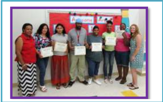
Pictured above is one group of proud parents who completed the sessions in Pageland.

The Value of the Program can be found in the words of the people who experience them... This program really opened my eyes to a better style of parenting. Focusing more on the positive than the negatives. I can be more calm and take things one step and one behavior at a time. This has been a wonderful experience and I encourage everyone to take this course.