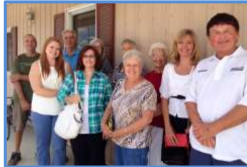
Pictured above are some of our most faithful volunteers.

Located on the campus of First Baptist Church of Pageland, BRC employs a holistic approach to family assistance, not only meeting immediate nutritional needs but also providing comprehensive assistance information and making spiritual guidance available to those who express such a need. BRC distributes emergency food and provides access to assistance by identifying appropriate resources and helping initiate the process for securing those resources through The Benefit Bank program.