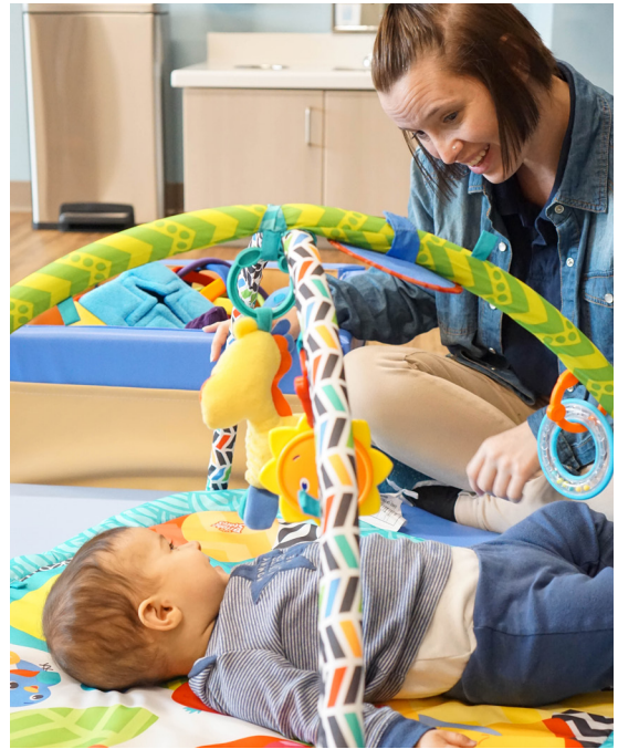
In Spartanburg County, where KRA scores are consistently below the state average, Spartanburg County First Steps is using READY funds to improve the quality of child care in underserved areas.

In its inaugural year, READY funds have enabled First Steps to sustain and expand evidence-based parenting programs, increase the quality of child care, and address pressing workforce and infrastructure challenges.